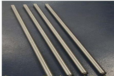
Support Rods (4) and Bolts (8)