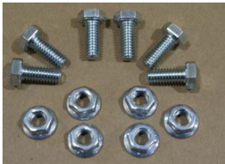
Hardware Pack (6 ea. Nuts & Bolts) *style may vary