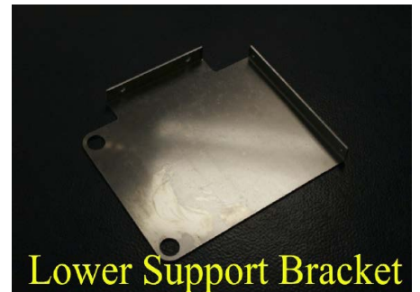
Lower Support Bracket