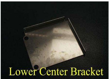
Lower Center Bracket